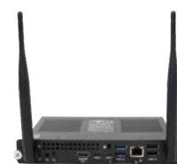
SMART OPS PC Module The power of Windows® 11 Pro—no laptop needed