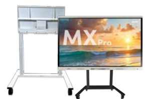
SMART Mobile Stands Add flexibility and mobility