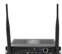
SMART OPS PC Module The power of Windows® 11 Pro—no laptop needed