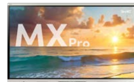
SMART Board® MX Pro series Where productivity and collaboration meet