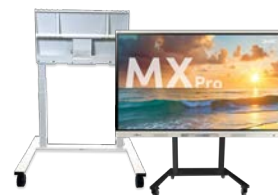
SMART Mobile Stands Add flexibility and mobility