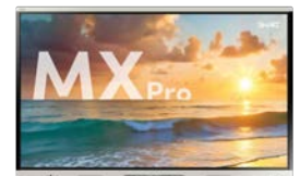
SMART Board® MX Pro series Where productivity and collaboration meet